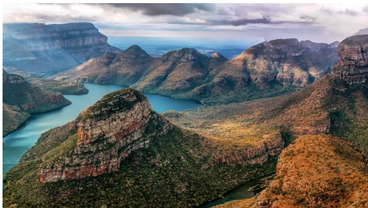
Breathtaking views of Blyde River Canyon