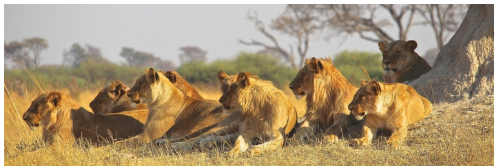
Spot a pride of lions taking a break, a rare chance in the wild

On arrival in Toronto, we catch our continuing flights to our homes across Canada.