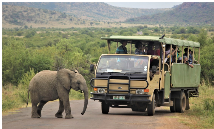
Enjoy opportunities to see a variety of game