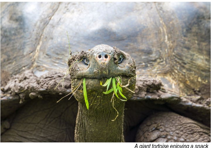
A giant tortoise enjoying a snack