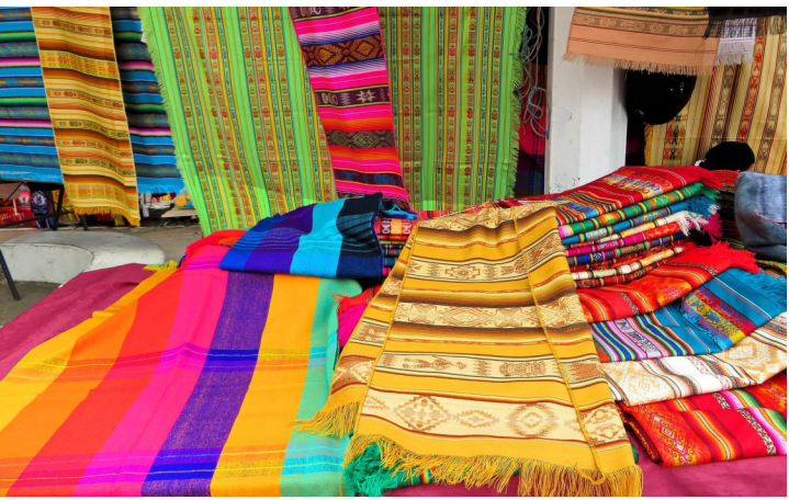
Colourful textiles in a market in Otavalo

lounging on the white sand beach. Galapagos hawks fly over iguanas sunbathing along the shore. Following a walk, we can enjoy a swim along the natural wave barrier or take a ride on a glass bottom boat. The turquoise waters contrast brilliantly with the white sand and black lava shoreline of the South Plaza Island. Inland, a carpet of scarlet sesuvium succulents serves as groundcover for the grove of luminescent green prickly pear cactus. Along the coast, we'll find sea lions, frigates, swallow-tailed gulls, and shearwaters. BLD