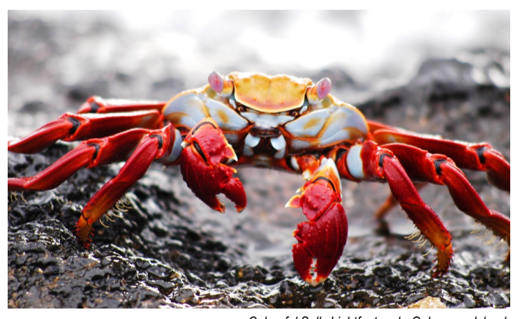
Colourful Sally Lightfoot crab, Galapagos Island