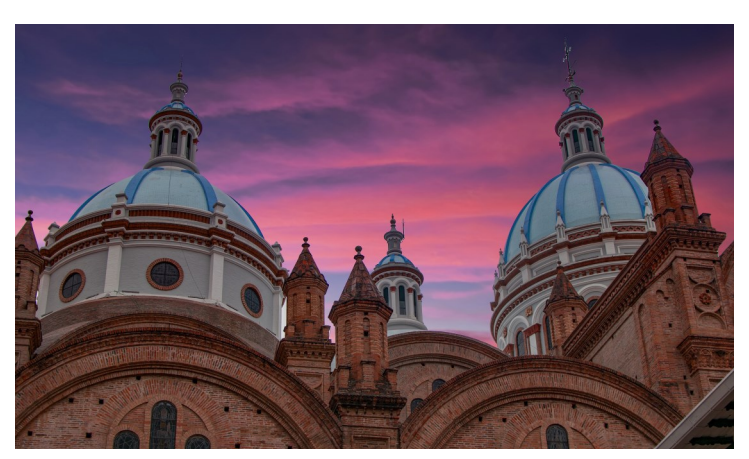
Blue Domes of the Cathedral in Cuenca