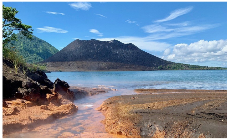
Conflict Islands, Papua New Guinea

SINGAPORE: Located at the cross roads of Asia, this city-state is a magical blend of cultures, colonial heritage, natural wonders and towering skyscrapers. For centuries, traders from across the globe have used this huge safe port and today we find one of the most beautiful and modern cities in the world. The food scene runs the gamut from hawkers to Michelin stars, and merits a trip alone.