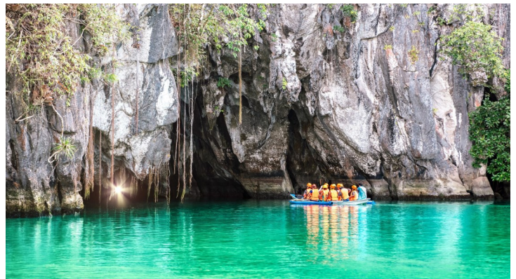
Puerto Princesa, Courtesy of Holland America Line

Despite rapid development, nearly half the island is developed, leaving room for parks and open spaces such as the Bukit Timah Nature Reserve, where an old-growth forest still thrives.