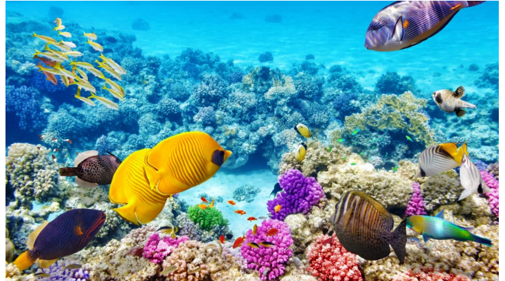
Great Barrier Reef