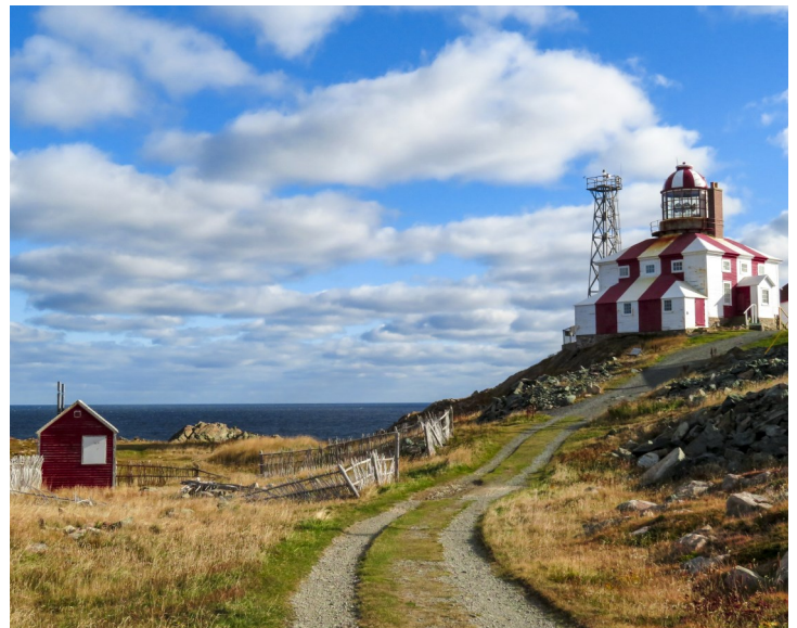
Bonavista