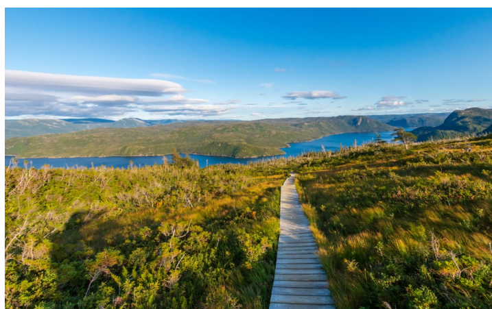
Gros Morne National Park UNESCO World Heritage Site