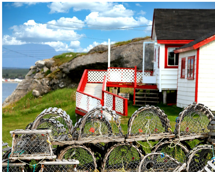
Newfoundland's culture is built on fishing!

Enjoy some free time this morning before we gather and transfer to the airport to catch our flight(s) home across Canada. As we fly homeward it will be with many delightful memories of an authentic Newfoundland experience that will be recalled for years to come. B