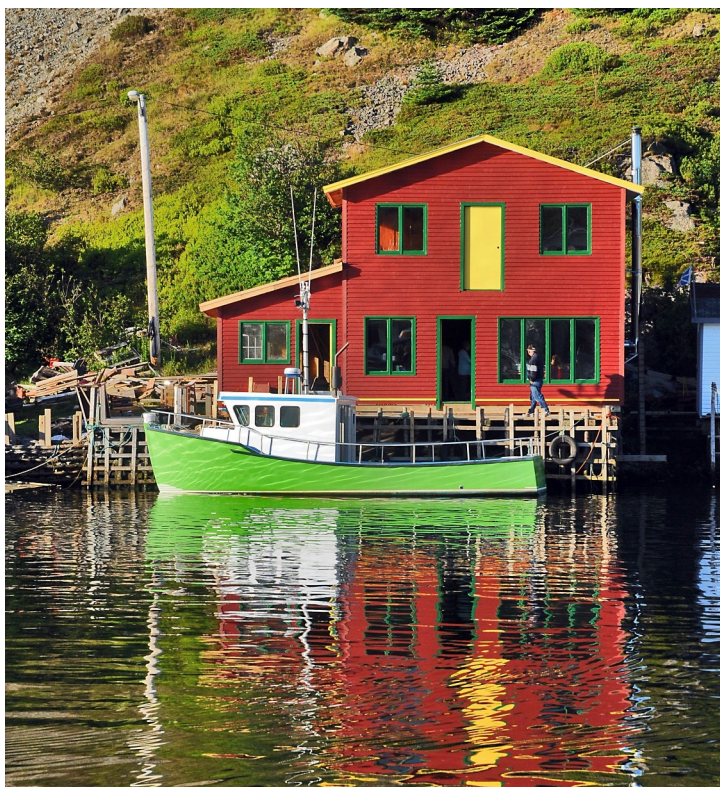
Quidi Vidi, Avalon

To reserve your places on this tour, complete the enclosed enrolment form, indicating the tour and your home city, and forward it with your deposit to: