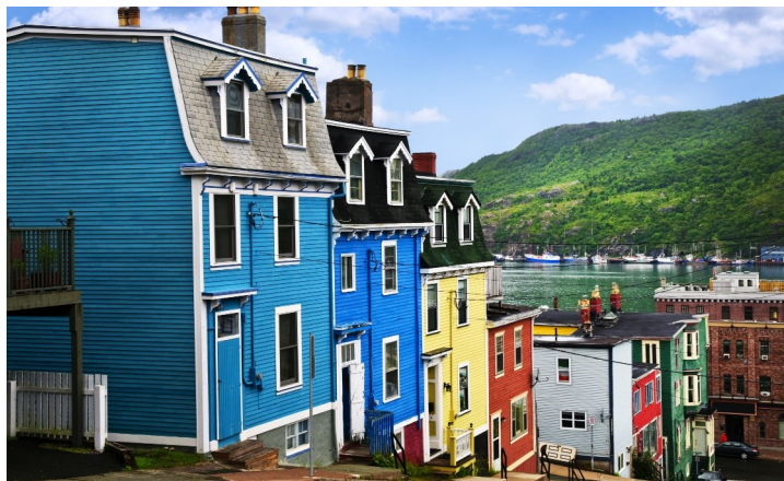
The colourful "Jellybean Row" in St. John's