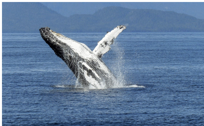
Humpback whales are the most commonly seen whales in Newfoundland

Enjoy a thrilling visit to Trinity this morning, one of the oldest communities in North America, and one of the gems of the island. Then it's out to Cape Bonavista for a chance to walk the cliffs and enjoy the spectacular coastal scenery. This afternoon is spent in Bonavista, the landfall of John Cabot in 1497. Here we visit the Ryan Premises and have an opportunity to learn from the locals about inshore fishing techniques that have allowed this town to thrive for hundreds of years. BL