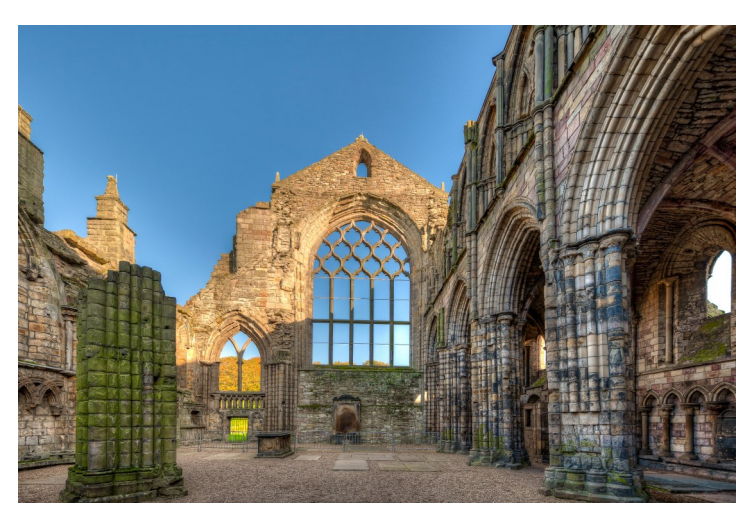
Holyrood Palace, official residence of the King in Edinburgh

CT Rating 3 / 5 - Moderately Challenging: This journey features a relatively fast-paced itinerary with a good deal of coach travel and visits to some remote parts of Scotland. Some of the hotels are relatively simple but clean and comfortable. Porters may not be available at all hotels and members should be prepared to move their own luggage when required.