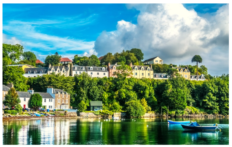
The vibrant town of Portree on the Isle of Skye