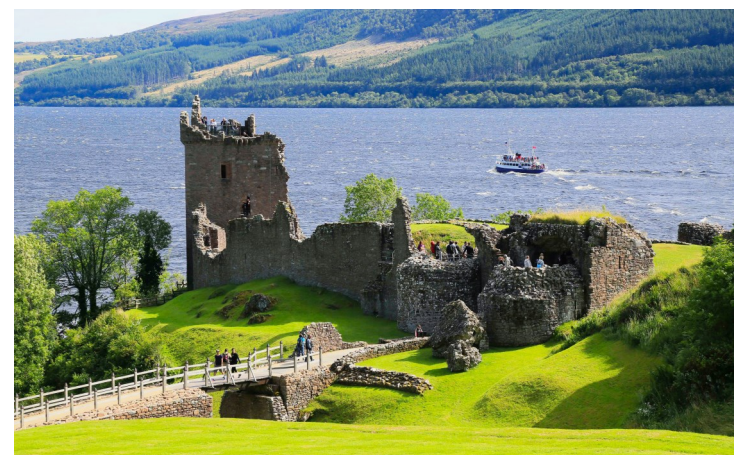
Urguhart Castle and the enigmatic Loch Ness