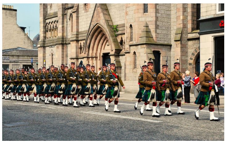
A snapshot of life in Aberdeen