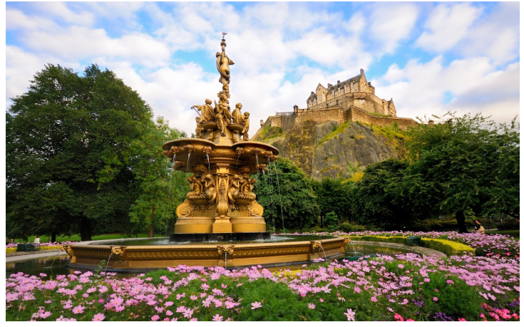
Views of the beautiful Edinburgh Castle