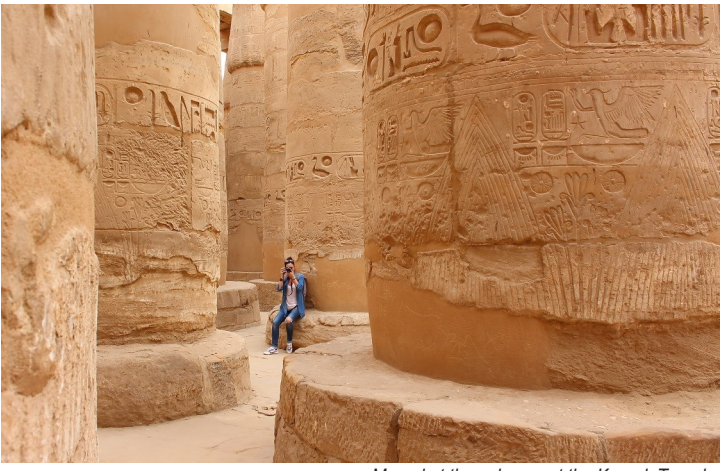
Marvel at the columns at the Karnak Temple

This morning we visit the stunning Luxor Temple (circa 1200 BCE). Passing through the Avenue of Sphinxes, view the phenomenal scale of the stonework. After a short flight to Cairo, we proceed to EL Moez Street and walk through old Cairo to experience the best Islamic medieval treasures, including traditional schools, mosques, and Sabil