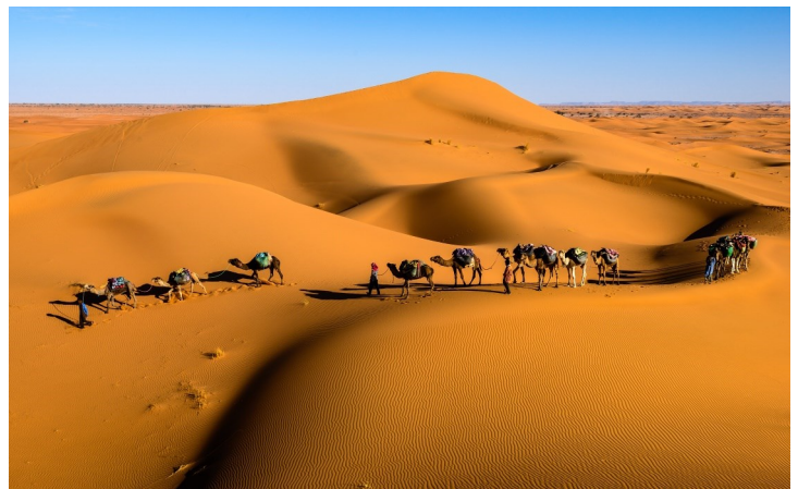
Enjoy a camel ride in the Sahara