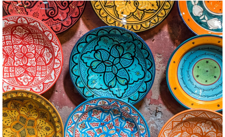
Traditional ceramic Moroccan bowls