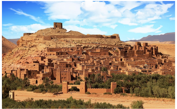
Aït-Ben-Haddou Kasbah