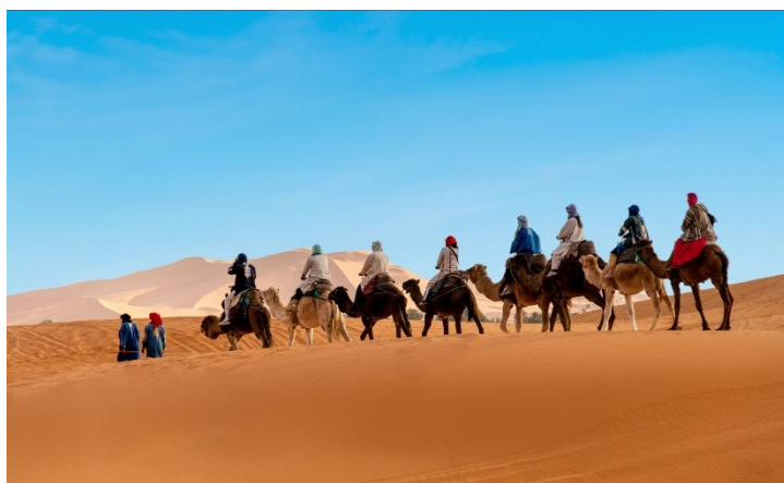
Atop a camel, watch the sunset blaze over endless amber sands