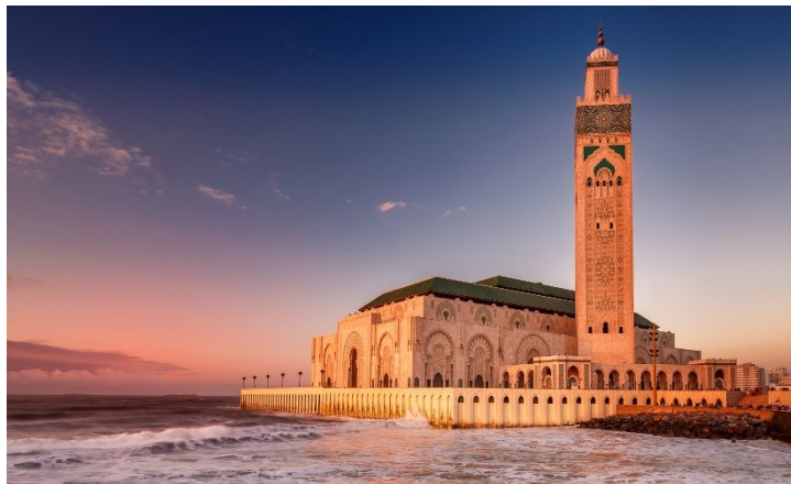
Soaring over the Hassan II Mosque, this 689-foot minaret is the world's tallest