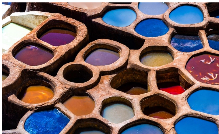
Centuries-old tanning pits brimming with vivid leather dyes in Fez

Today, we journey through extraordinary red rock formations to reach the stunning Dades Gorge. This area is often referred to as "Kasbah Country" due to the impressive forts that grace the valley, evoking memories of