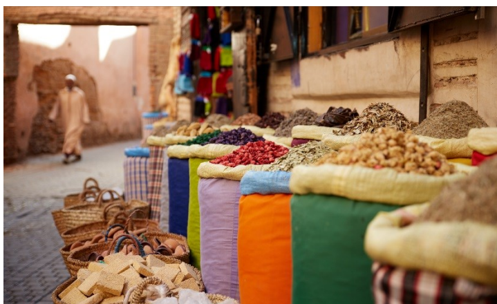
Wander through Marrakesh's vibrant souks lined with textiles and spices