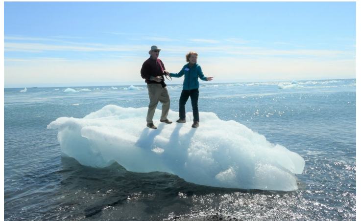
Glacier Lagoon