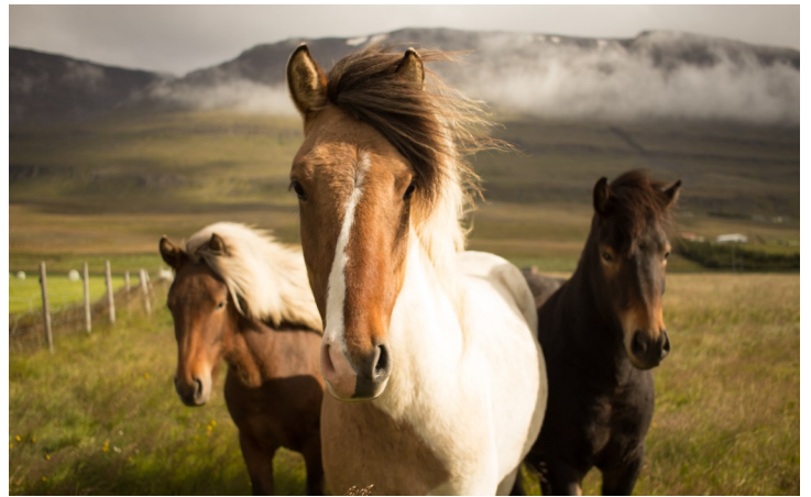
Indigenous horses of Iceland

An exhilarating cruise exploring the natural paradise of Breioafjorour Fjord awaits in the charming village of Stykkishólmur. Relax as we observe the fantastic island scenery and dramatic tidal flows featuring a variety of bird life, including: puffins, eider ducks, kittiwakes, fulmars and the white-tailed eagle. Along the north coast, there are a number of remote and quaint fishing enclaves where we will cast out a small net-plough and drag the seabed for some shellfish delicacies which everyone will have an opportunity to sample. We will continue our exploration as we drive around Snafellsnes. Rounding the tip of the peninsula with the icecap and volcano towering above us, we pass Arnarstapi, a region of unusual columnar basalt rock formations that have been eroded by the pounding waves. We drive through barren lava fields, past fertile farmlands and the Eldborg crater en route back to our hotel. BD