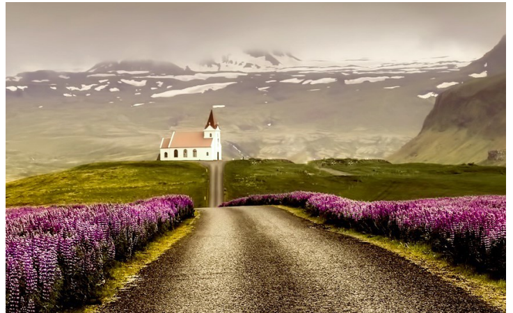
Scenic landscapes await

Journey south through the sheltered eastern fjords and past small fishing villages like Reyoarfjorour and Faskruosfjorour, stopping for brilliant photo opportunities.