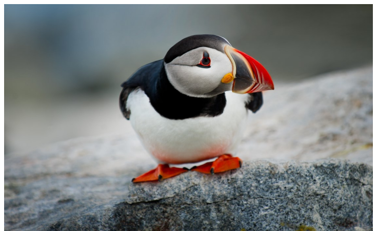
Observe puffins in their natural environment