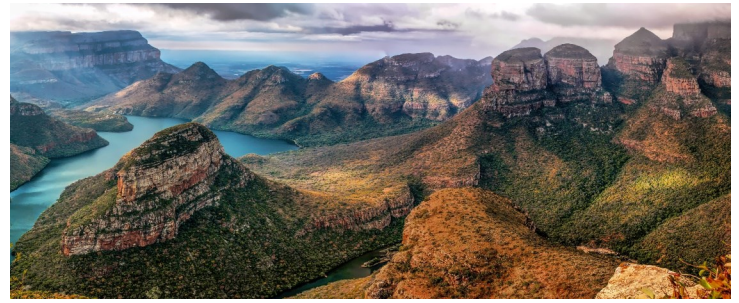
Breathtaking views of Blyde River Canyon

Enjoy a guided walk through the National Botanical Garden in Kirstenbosch, a 528 hectare natural area set on the slopes of Table Mountain with over 10,000 different native flowers and plants. Following a lunch break, we will visit the penguin colony at Boulders Beach. Delight in the magnificent scenery as we drive to Cape Point, on the tip of the Cape of Good Hope. BL