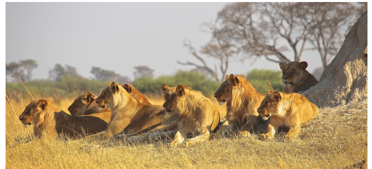
A pride of lions enjoying the shade

Enjoy a leisurely morning relaxing or exploring on your own (members can take a cruise on the Lagoon). Our afternoon is highlighted by a reception at Theodora Creche, hosted by the local community and a visit to a local soup kitchen. With your help, we support both of these operations financially. Enjoy a short nature walk on Robberg Nature Reserve followed by a glass of champagne. Following this we will share a homemade dinner with South Africans in aid of the soup kitchen. BD