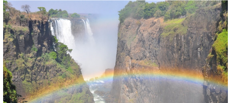
Experience the magnificent Victoria Falls in Zimbabwe

This morning we shall explore the fascinating Cango Caves followed by a visit to an ostrich farm to learn more about these fascinating birds and to enjoy a lunch featuring its eggs and very lean meat. This afternoon we descend the Outeniqua Pass and drive through the Garden Route Lakes District to the resort centre of Knysna.