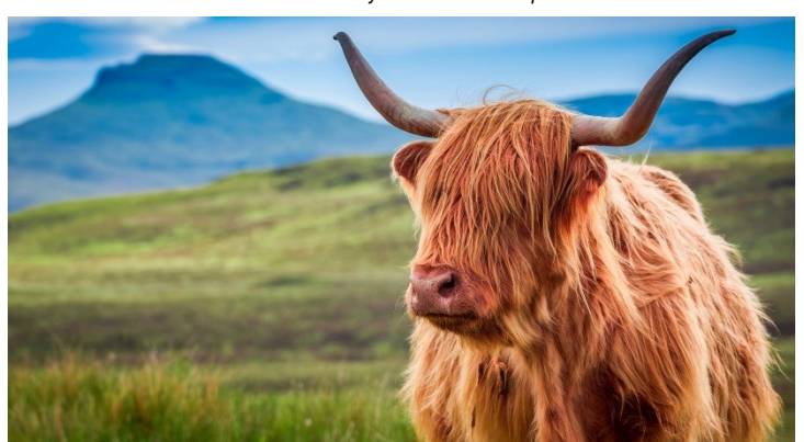
The iconic Scottish Highland Cattle

Newcastle upon Tyne, England: Newcastle upon Tyne is a classic city of England's north country, where you can visit reminders of some 2,000 years of British history. A short drive outside of town offers the chance to stroll along sections of Hadrian's Wall, built by Romans as a defence against Scottish invaders. A walk through the city finds a mix of modern and old, with new structures like the Gateshead Millennium Bridge alongside Victorian storefronts, Edwardian marketplaces and remnants of the Industrial Revolution. Newcastle also makes a great jumping-off point for exploring nearby historic towns like Durham and Alnwick, with their impeccably maintained gardens, historic castles and soaring cathedrals.