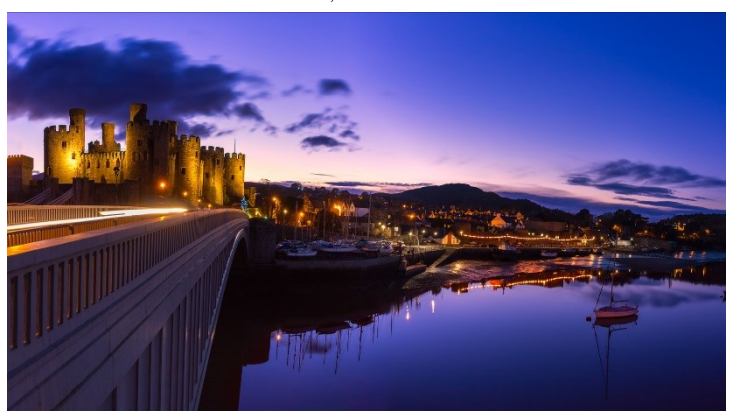
Conwy Castle—a masterpiece of medieval architecture