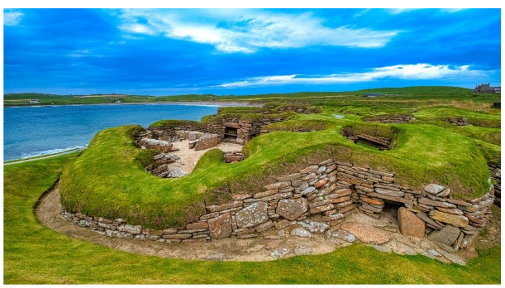
Skara Brae, a Neolithic settlement a near the town of Kirkwall

Kirkwall, Shetland Islands, Scotland: While the southernmost isles of Orkney closely straddle the northeast corner of the Scottish mainland, historically the archipelago (around 70 islands in all) and its people have had as much in common with Scandinavia as they have had with Scotland. In fact, until the 15th century, the Orkney Islands were politically part of Norway. Today the Orcadians are a fairly tight-knit and cooperative group of Scots-a rich community of artists, farmers, fishermen, and tradesmen. A key attraction for tourists is the wealth of prehistoric sites on Orkney, including standing stones, burial chambers and even Stone Age settlements, such as Skara Brae, inhabited sometime around 3000 B.C.E. In the capital Kirkwall you'll find the Cathedral of St. Magnus-one of only two pre-Reformation cathedrals still largely intact in Scotland. Nearby, the historic town district includes the Earl's Palace, built for the infamous Earl Patrick Stewart, whose father was a bastard son of King James V.