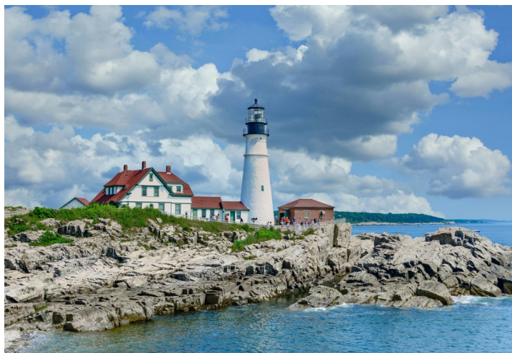
Take in spectacular views of Maine's rocky shoreline