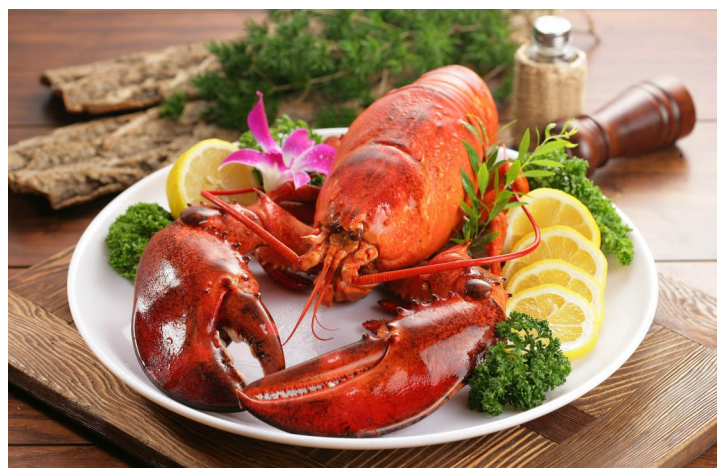
Boston lobsters are a highly praised seafood specialty!