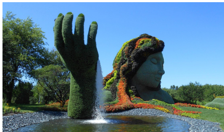
Nature awaits you at the Montreal Botanical Garden