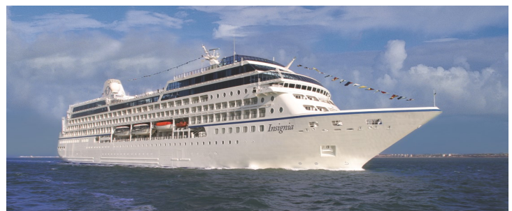
ms Insignia : 30,277 tons and 656 passengers