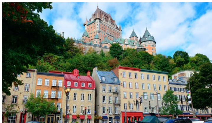
Explore the iconic Château Frontenac

Charlottetown, PEI, Canada: Trace the birth of Canada where it happened in 1864 on the waterfront in what is now Founder's Hall. The past also comes alive along historic Great George Street. Don't miss the Neo-Gothic St. Dunstan's Cathedral, or the Confederation Centre of the Arts to see the original manuscript of the beloved Anne of Green Gables, which was set on Prince Edward Island.