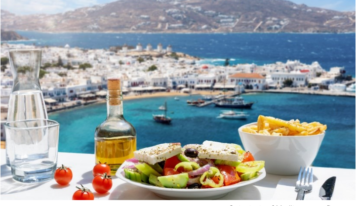
Get a taste of Mediterranean flavours