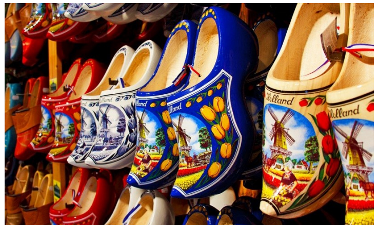
Traditional wooden Dutch clogs