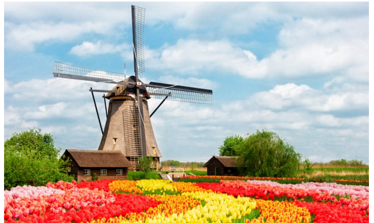
Windmills, a symbol of Dutch heritage and craftsmanship