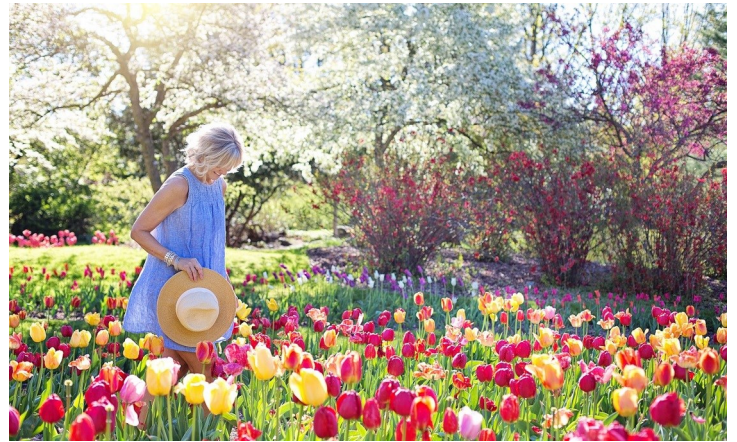
The Netherlands is ablaze with colour in the springtime

Antwerp, the second-largest city in Belgium, welcomes us today. Our morning will be dedicated to touring Brussels, the captivating capital of Belgium. Be enchanted by its