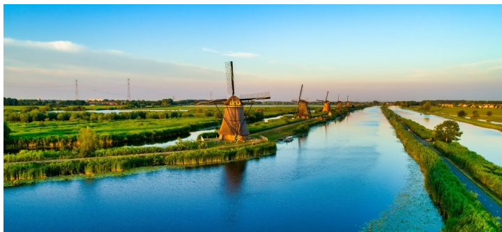
Explore the traditional windmills of Kinderdijk, Netherlands

All too soon our journey through the Dutch waterways draws to a close as we say "tot ziens" (good day) to our newfound friends and board our return flights to Canada. B