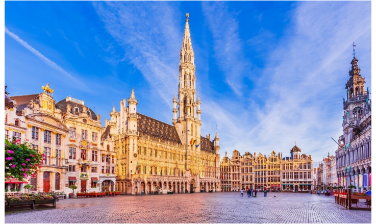
Architectural marvels and cultural delights await in Brussels