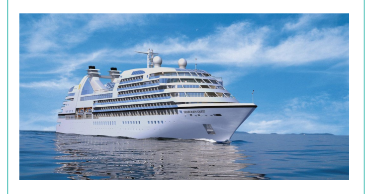
All aboard the luxurious Seabourn Quest

Seabourn Quest is the third iteration of the vessel design that has been called 'a game-changer for the luxury segment.' True to her Seabourn bloodlines, wherever she sails around the world, Seabourn Quest carries with her a bevy of award-winning dining venues that are comparable to the finest restaurants to be found anywhere. She offers a variety of dining options to suit every taste and every mood, with never an extra charge. With world-class entertainment and enriching activities, each day on board will inspire incredible experiences. At only 650 feet long and 84 feet wide she can host just over 400 guests in 229 suites.