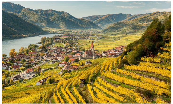
Savour world-famous wines in Weissenkirchen, Austria