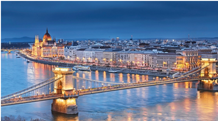
The Széchenyi Chain Bridge is one of the most iconic symbols of Budapest

Our journey comes to an end as we disembark and transfer to the airport to catch our flights bound for across Canada. B