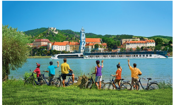
Unveil the Danube's allure on an optional bike tour.