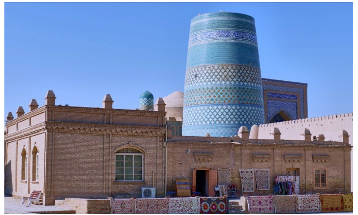
Kalta Minor Minaret, built in 1851 by Mohammed Amin Khan in Khiva

Nestled in the foothills of the Alai Range, Rishtan is renowned for its ceramics due to the excellent quality of the local clay. Modern ceramics are noted for their floral and geometric designs in vibrant shades of blues and greens. Enjoy lunch at the residence of a master artist and tour his private studio. Take in the scenic countryside as we make our way to Kokand. Asmald Palace Hotel (1 night)