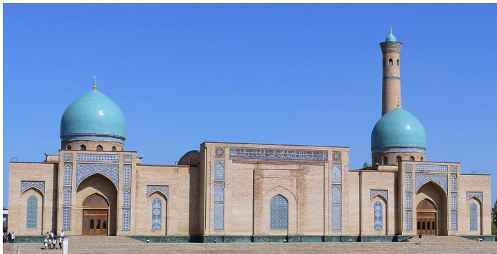
Tillya Sheikh Mosque with the world's oldest Koran