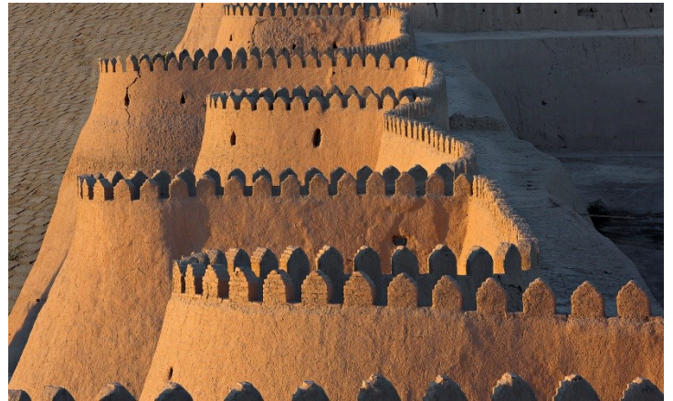
Old walls of Itchan Kala's fortress, a UNESCO world heritage site

Travel by fast train to legendary Samarkand, a UNESCO World Heritage Site. Built on the ruins of the ancient site of Afrasiab and once called Marakanda, the city is on the main Silk Route between China and Europe. Visit the Gur-Emir Mausoleum, the final resting place of Tamerlane, which was actually built for his grandson. The heavily gilded central dome opens over a set of marble tomb-markers (only Tamerlane's is made of solid jade). Tamerlane's Bibi-Khanym Mosque was the largest in the Islamic world. The very colourful Siab Bazaar is a must for everyone.