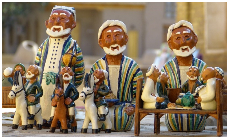
Traditional Uzbek ceramic figures