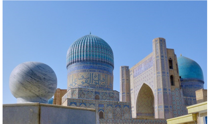
Stunning tilework at Bibi-Khanum Mosque

Samarkand, 'the 'Rome of the Orient', was a thriving trade and religious centre before the rise of Rome and Babylon. The city's masterpiece is Registan, a square adorned with three iconic madrasahs. Originally the main marketplace, Registan's name translates to 'place of sand.' Explore the tombs and mausoleums of Shah-i-Zinda ("place of a living king"). Do not miss the highly recommended Afrasiab Museum. Tonight, enjoy an exclusive dinner prepared by a master chef in their home.